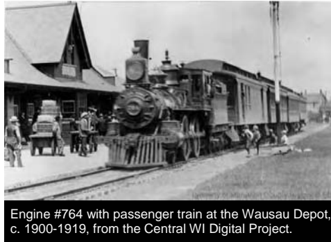
Engine #764 with passenger train at the Wausau Depot, c. 1900-1919, from the Central WI Digital Project.

The digital Railroad Collection is provided by mem-